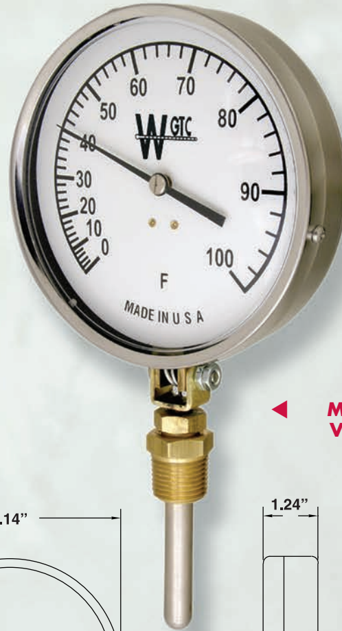
◀ MODEL VA45S