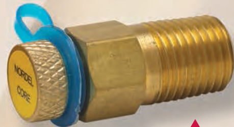
MODEL PT25NOR (1/4" NPT)