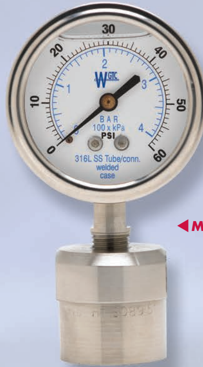
◀ MODEL DM-45