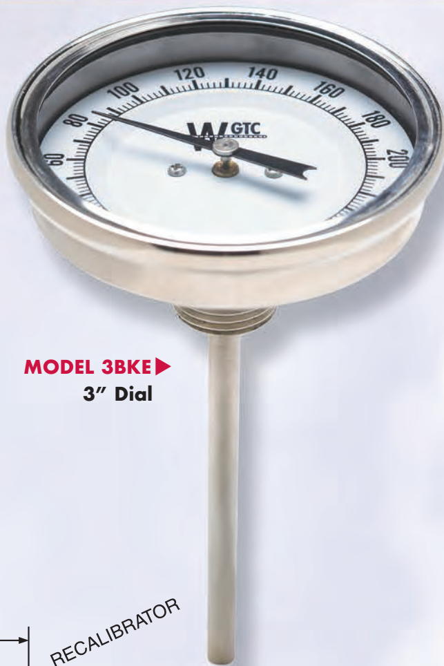
MODEL 3BKE ▶ 3" Dial