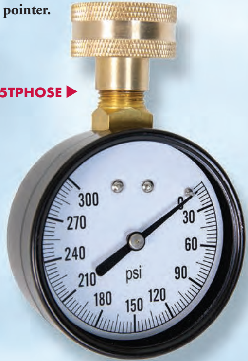
MODEL 25TPHOSE ▶