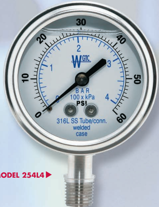
MODEL 254L4 ▶