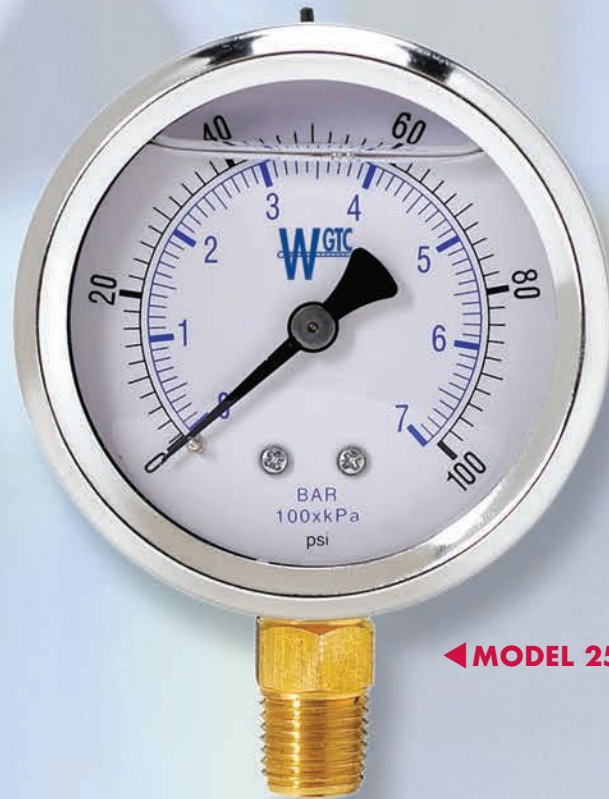
◀ MODEL 251L4