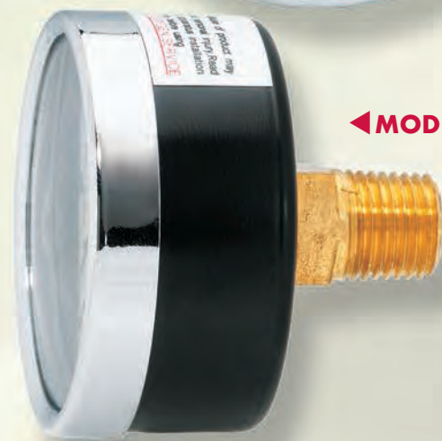
◀ MODEL 20TC