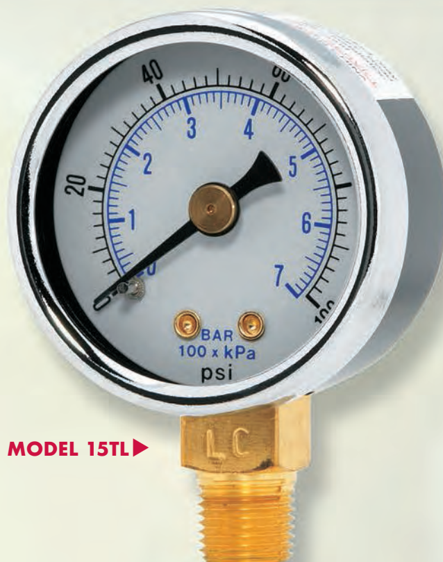
MODEL 15TL ▶