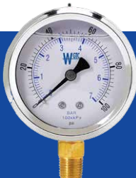
251L4 251C4 251U4 251F4