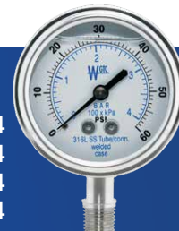
254L4 254C4 254U4 254F4