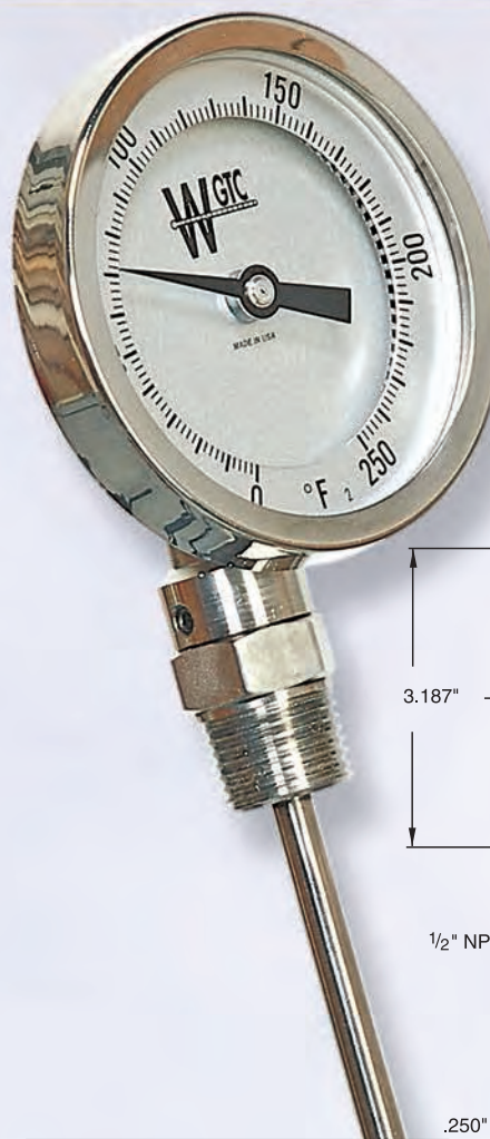
◀ MODEL 3BM 3" Dial 5" dial available. See page 16.