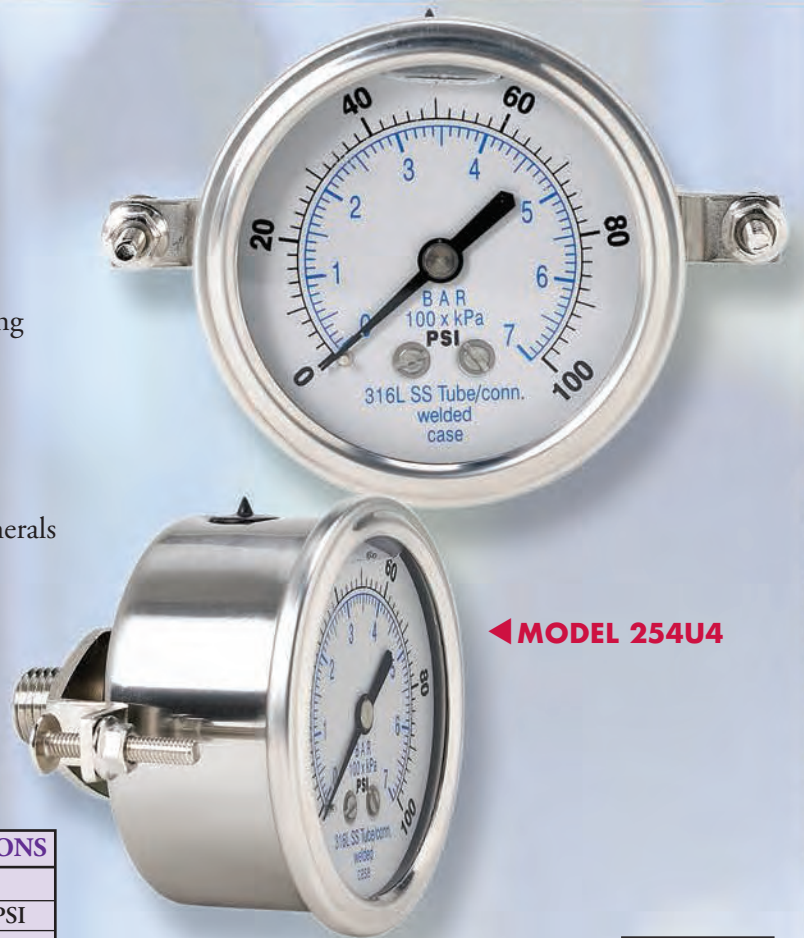
◀ MODEL 254U4