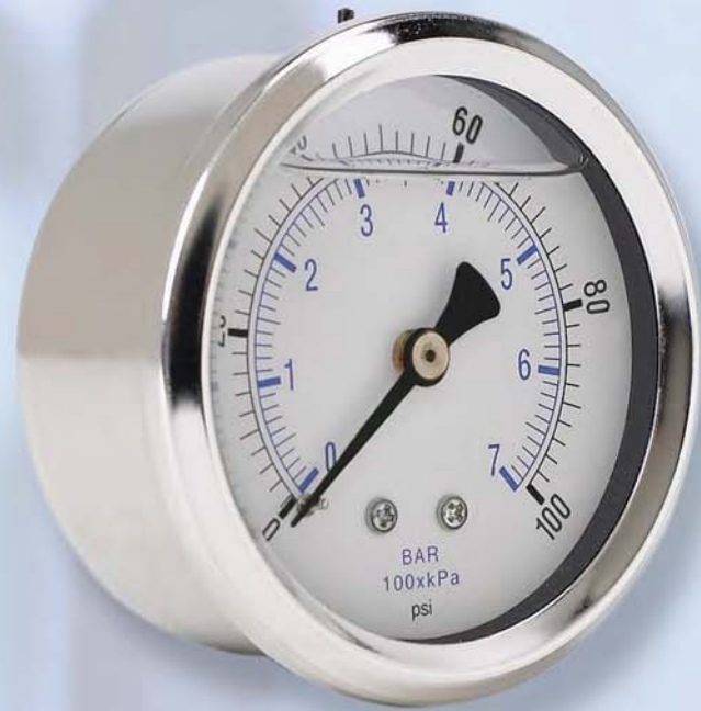
▲ MODEL 251C4