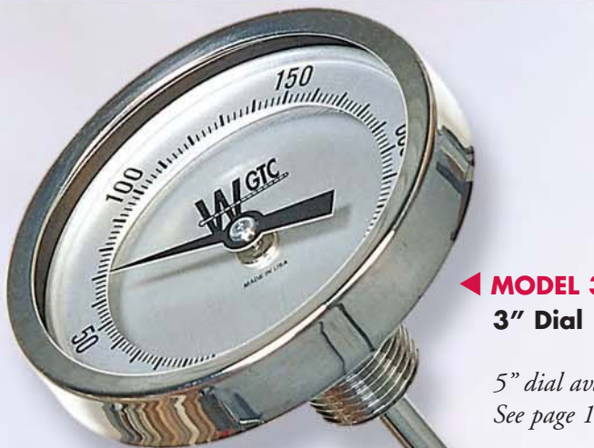
◀ MODEL 3BK 3" Dial