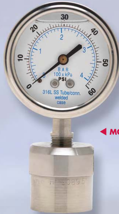
◀ MODEL DM-45